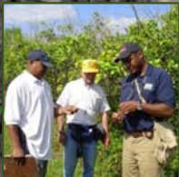
Early detection, rapid response