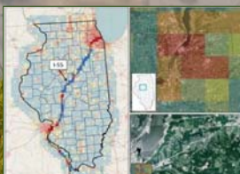
Harnessing Data in New Ways