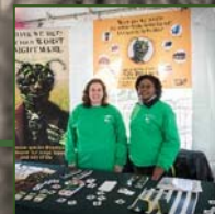
Education and outreach