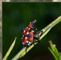
Control and management